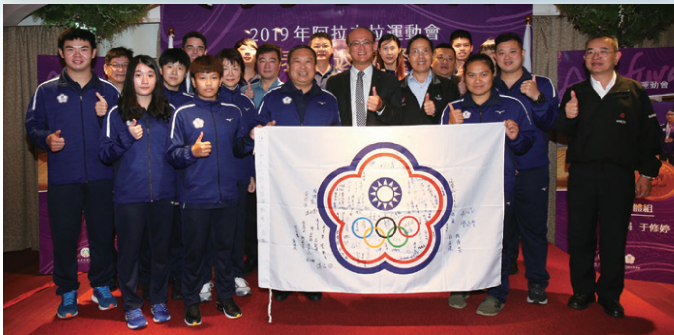
Taiwan's Arafura Games delegation presents a signed flag to Administrative Deputy Minister of Education Lin Teng-Chiao and Sports Administration Deputy Director-General Wang Shui-Wen

The 11 th Arafura Games came to an end on May 4, 2019, with the Taiwanese delegation achieving excellent results, bagging 9 gold, 4 silver and 5 bronze medals in total. To praise the outstanding performance of our delegation, the Sports Administration organized a banquet on May 7 with the Administrative Deputy Minister of Education Lin Teng-Chiao in attendance.