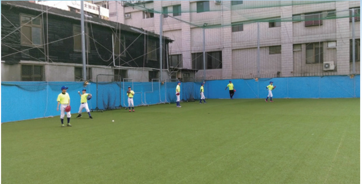
Baseball practice field of the Taichung Second Senior High School

Taiwan is actively preparing for the 2019 WBSC Premier12 to be held in Taichung at the end of this year in an effort to qualify for the 2020 Tokyo Olympics Baseball event. While everyone's attention is on high level competitive events, the Sports Administration is quietly continuing to promote baseball at a grassroots level and supplement facilities and services. In the 10 years from 2010 to 2019, the Sports Administration provided grants for the construction or renovation of 445 simple baseball fields at schools, including 45 new and 400 renovated fields, allowing students to enjoy the fun of baseball in a safe sporting environment.