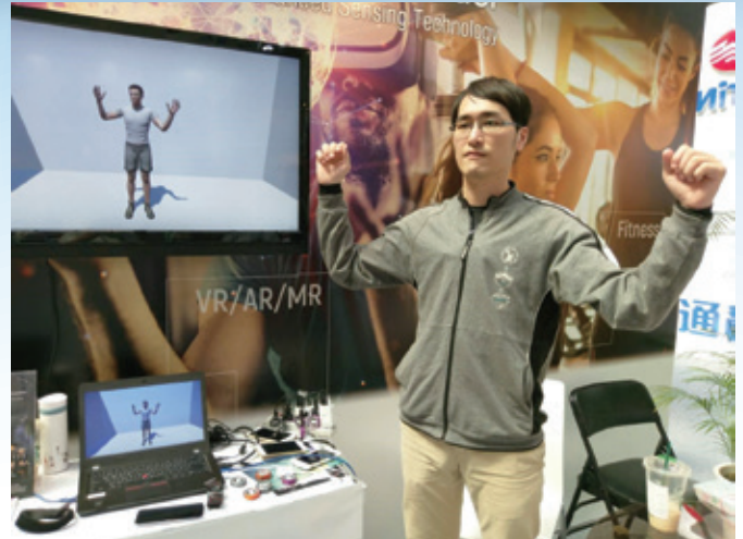
The Fuel Station team (left), J-MEX displaying its smart fitness clothing with multi-sensors (right)

In 2018, the Sports Administration commissioned National Chiao Tung University's Center of Industry Accelerator and Patent Strategy (IAPS) and HYPE Sports Innovation (HYPE) to jointly establish SPIN Accelerator Taiwan. The aim was to utilize the technology network of IAPS and its experience of nurturing almost 100 startup teams to help the teams taking part in this project to carry out technological integration spanning technology, manufacturing and service industries and take advantage of HYPE's international sports innovation resources to quickly enter the international market and offer more possibilities to Taiwan's sports innovation. Ten outstanding Taiwanese sports startup teams with potential participated in the 1 st training cycle of this project and graduated on March, 2019. Six sports startups teams, Tromin, Wusa, Velodash, 17FIT, Rema and GoMore have been introduced in previous issues of the Newsletter. In this issue, FuelStation and J-MEX will be introduced: