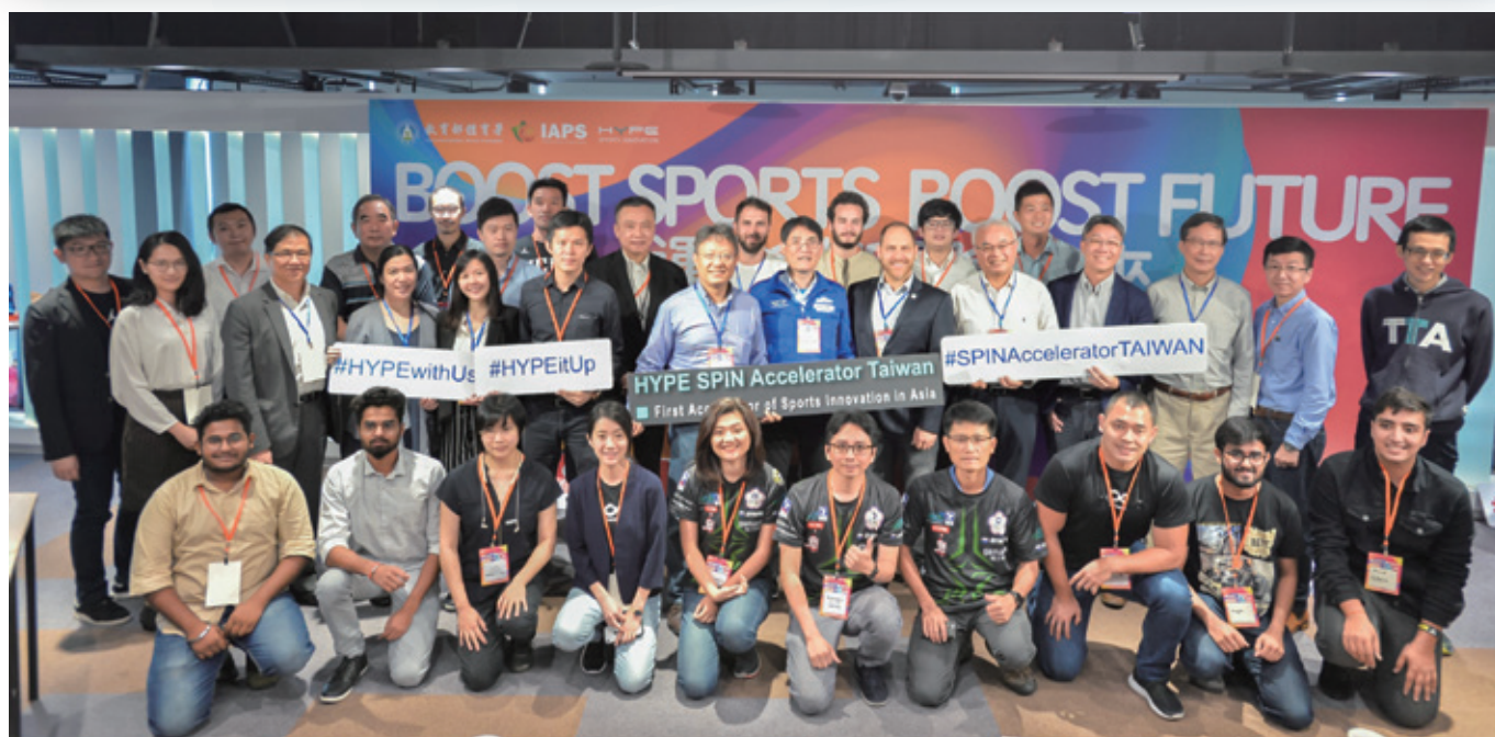
Group photo taken at the Kickoff Day of Spin Accelerator Taiwan 2 nd Training Cycle

SPIN Accelerator Taiwan, established by the Sports Administration using international resources, held its Kickoff Day on May 28, 2019 at Taiwan Tech Arena, officially launching the second training cycle. Thirteen startup teams participated in this training cycle, opening up a new channel for international exchange for Taiwan.